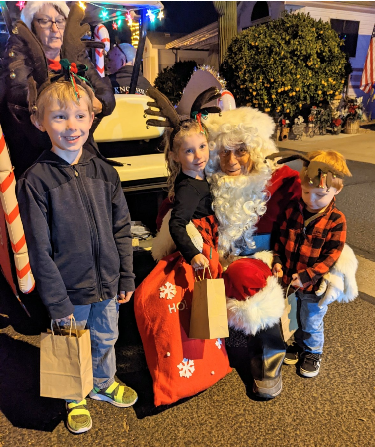
Last years Santa with kids!

Snowbird Café will be CLOSED for the Christmas Holidays on December 23, 26, 28, 30 and January 2.