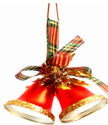
Christmas Parade 2021 entry Watch for this years!