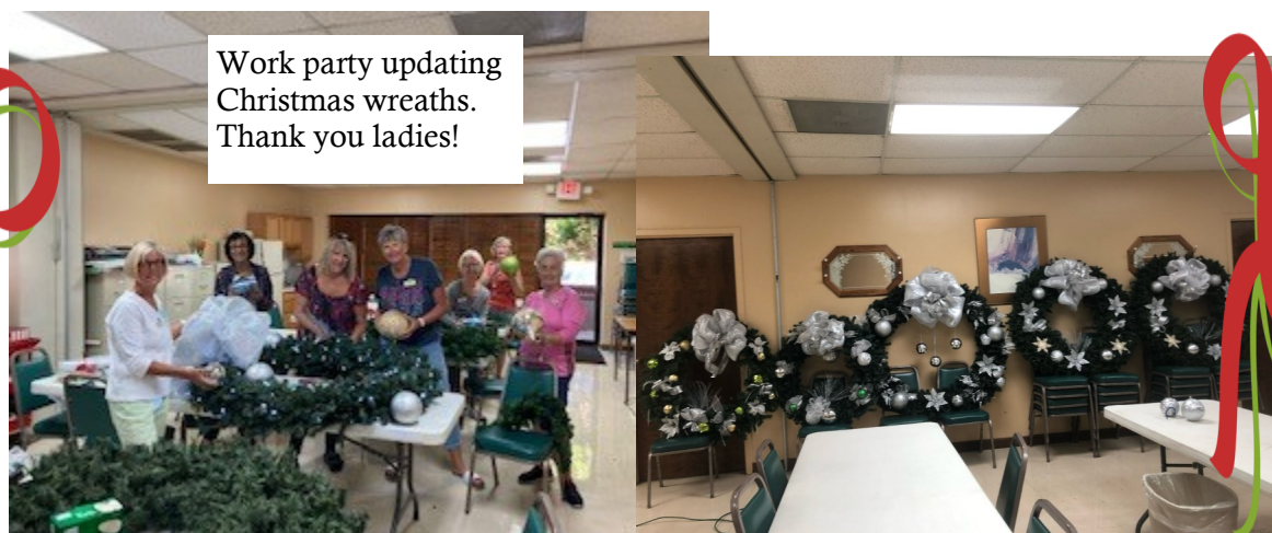
Work party updating Christmas wreaths. Thank you ladies!