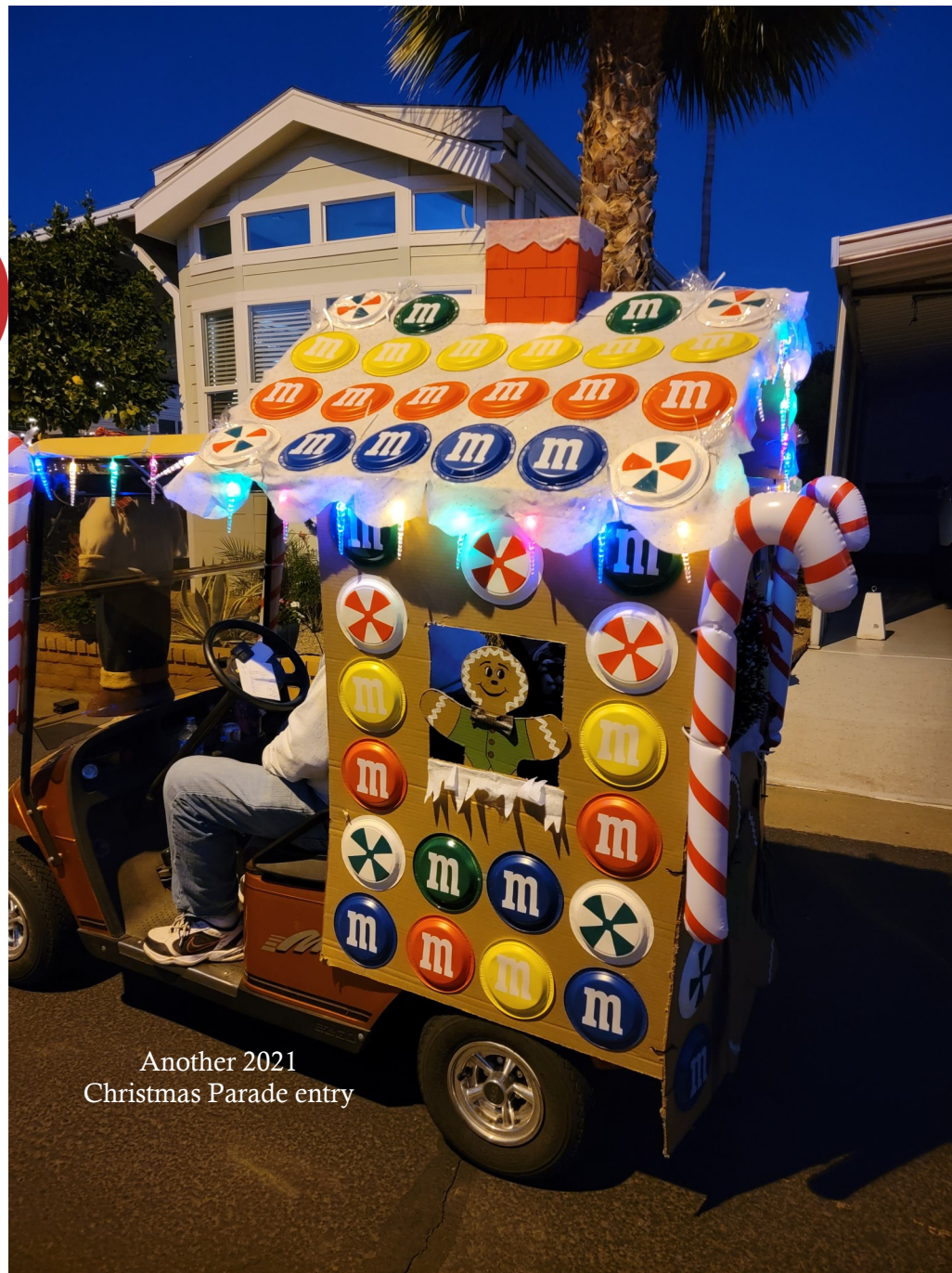
Another 2021 Christmas Parade entry