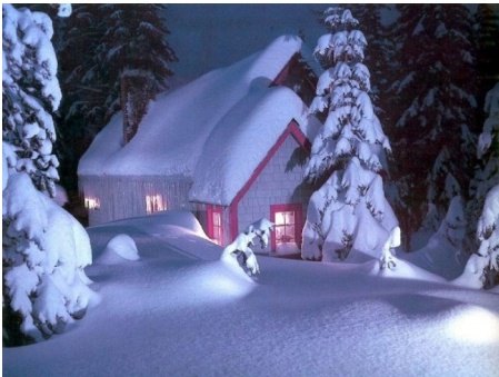
Aren't you glad you're in Arizona!

We are trying something different this season by having our first burger night on December 8 from 4-6 on the Patio or in the Ballroom depending on weather. The Billiards Club will be here as well having a 50/50. Be sure you come out and support these two great clubs! There will be dance music as well.