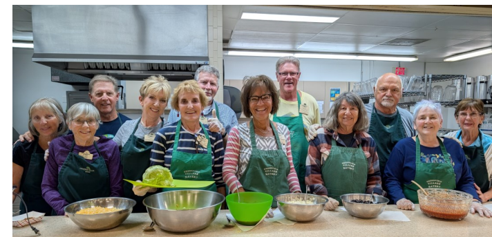
Our Happy Taco Crew January 26, 2026