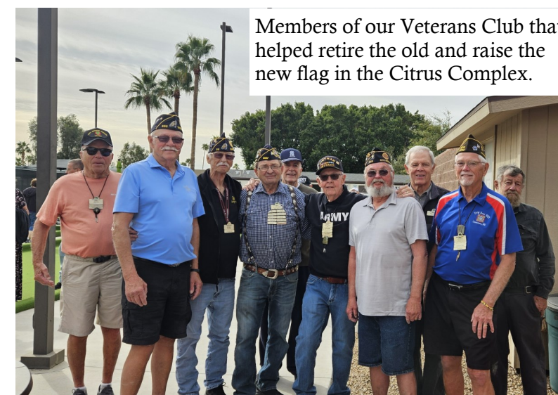
Members of our Veterans Club that helped retire the old and raise the new flag in the Citrus Complex.