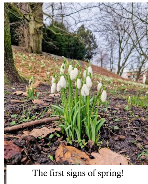
The first signs of spring!